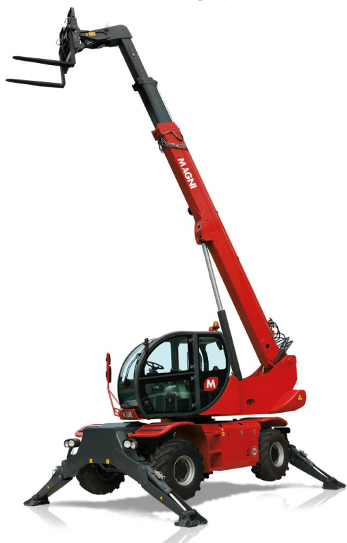
Load chart forklift with fork